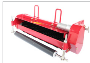
De-thatching reel - tipped