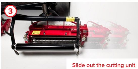
Slide out the cutting unit