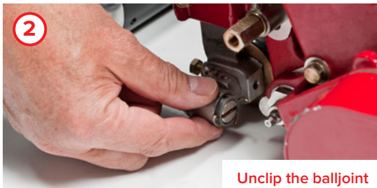
Unclip the balljoint