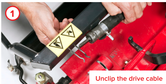
Unclip the drive cable

The LM315 cutting unit can be removed in seconds – no tools needed!